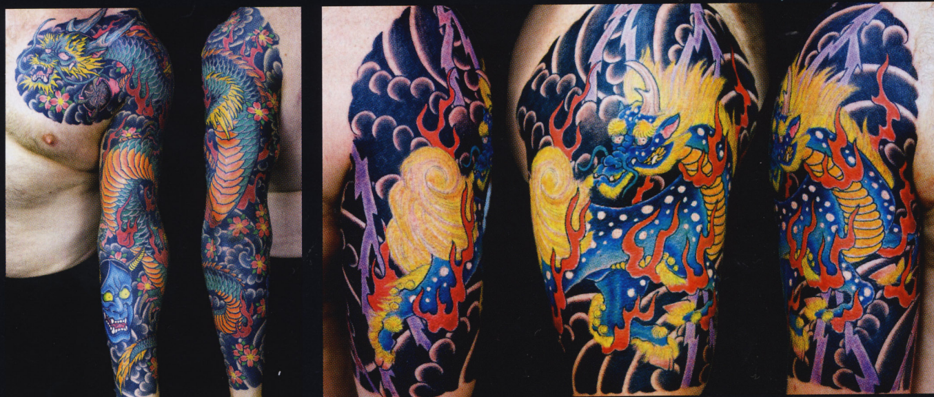
KIAN'S PHOTO BY MATTHEW LOWDEN